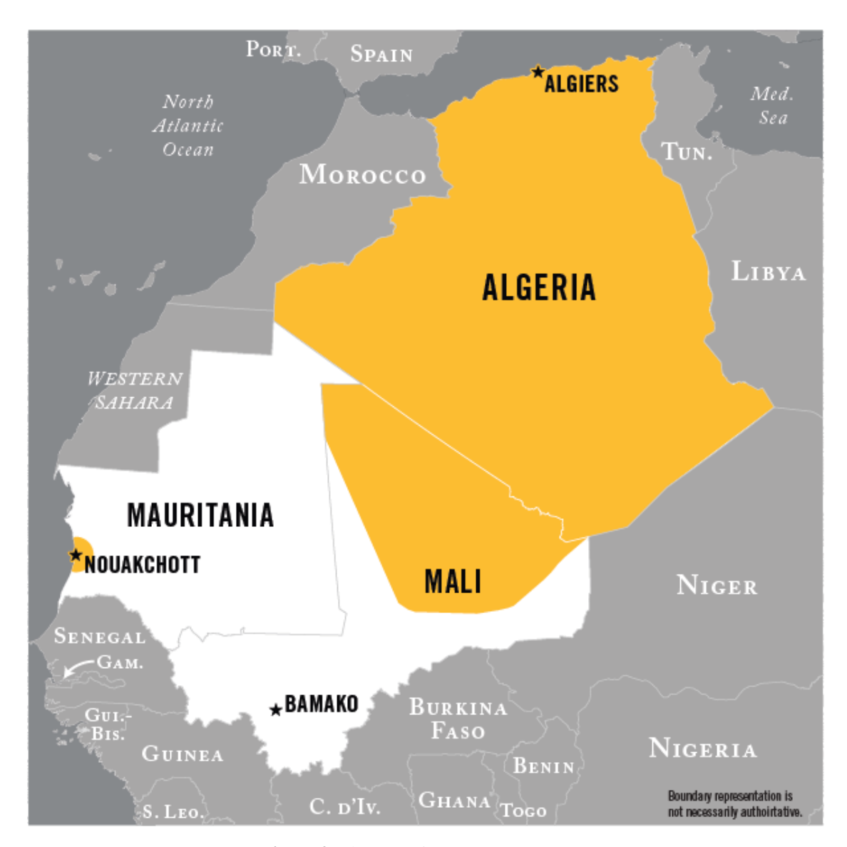
Figure 2. The countries AQIM operates on