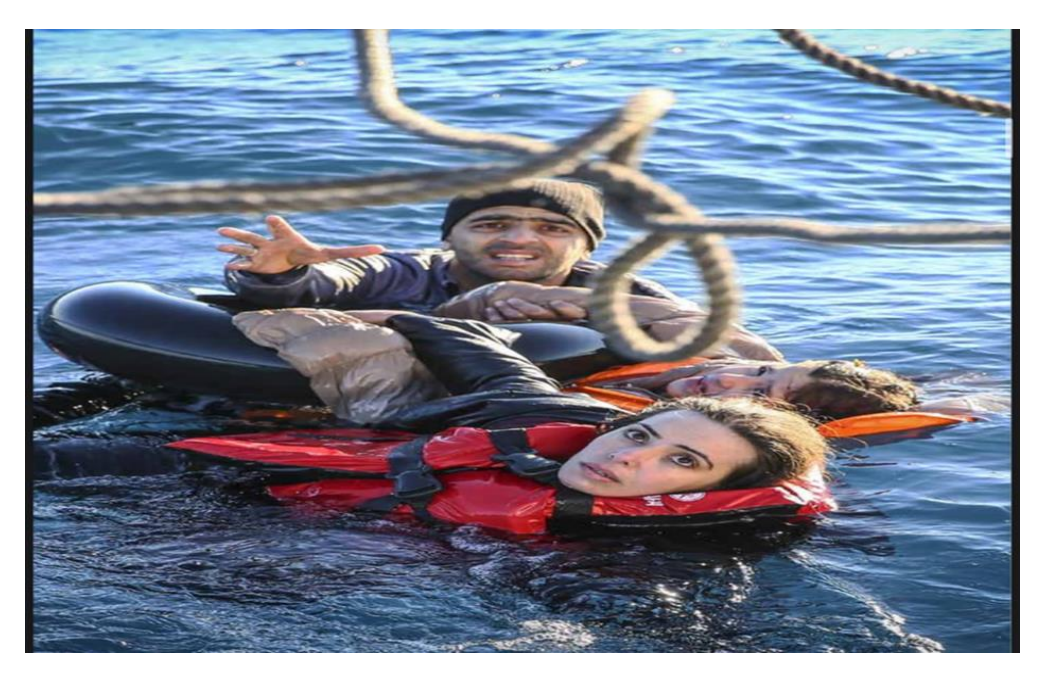
Figure 2. Picture for a Syrian Family crossing to Europe illegally through Turkey.

Another important problem that comes to mind when refugees and security are mentioned in the many "security" threats that asylum seekers will create in the society they will take refuge. As it is known, one of the most important fears voiced around the world is that the massive influx of refugees will cause local people to lose their jobs due to the cheap labor represented by the refugees and the security problems arising from the refugee communities. Concerns here focus not only on immigrants but also on the possibility of the emergence of a disorderly atmosphere that creates favorable conditions for terrorist groups and organized crime networks.